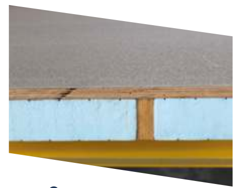
2mm GRP Anti Slip