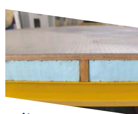
Alumininum Plate Base